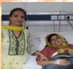
Rare Innocence Lost - Conservative Management of Cervical Pregnancy